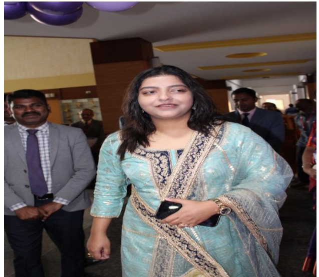
Guest of honour arriving for the Women's Day