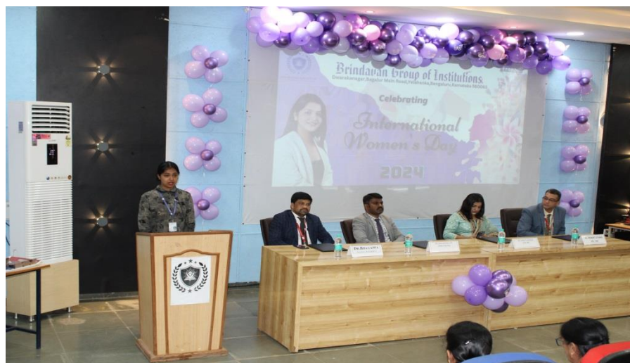
Invocation Song by the Student