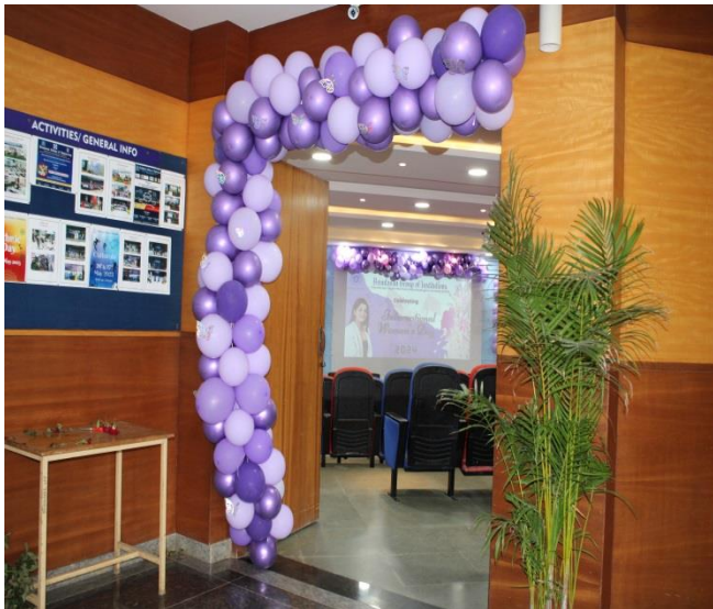
Entrance Decor for the International Women's Day