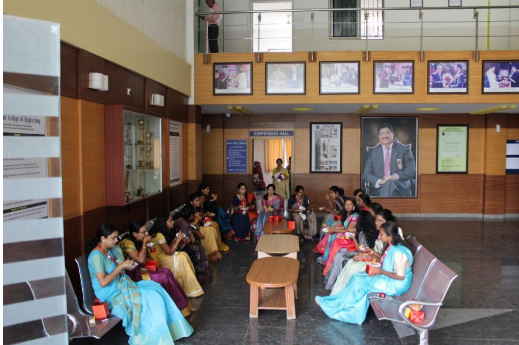
Refreshment of Women