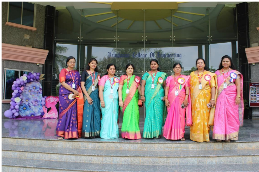
BGI Co-coordinators for International Women's Day